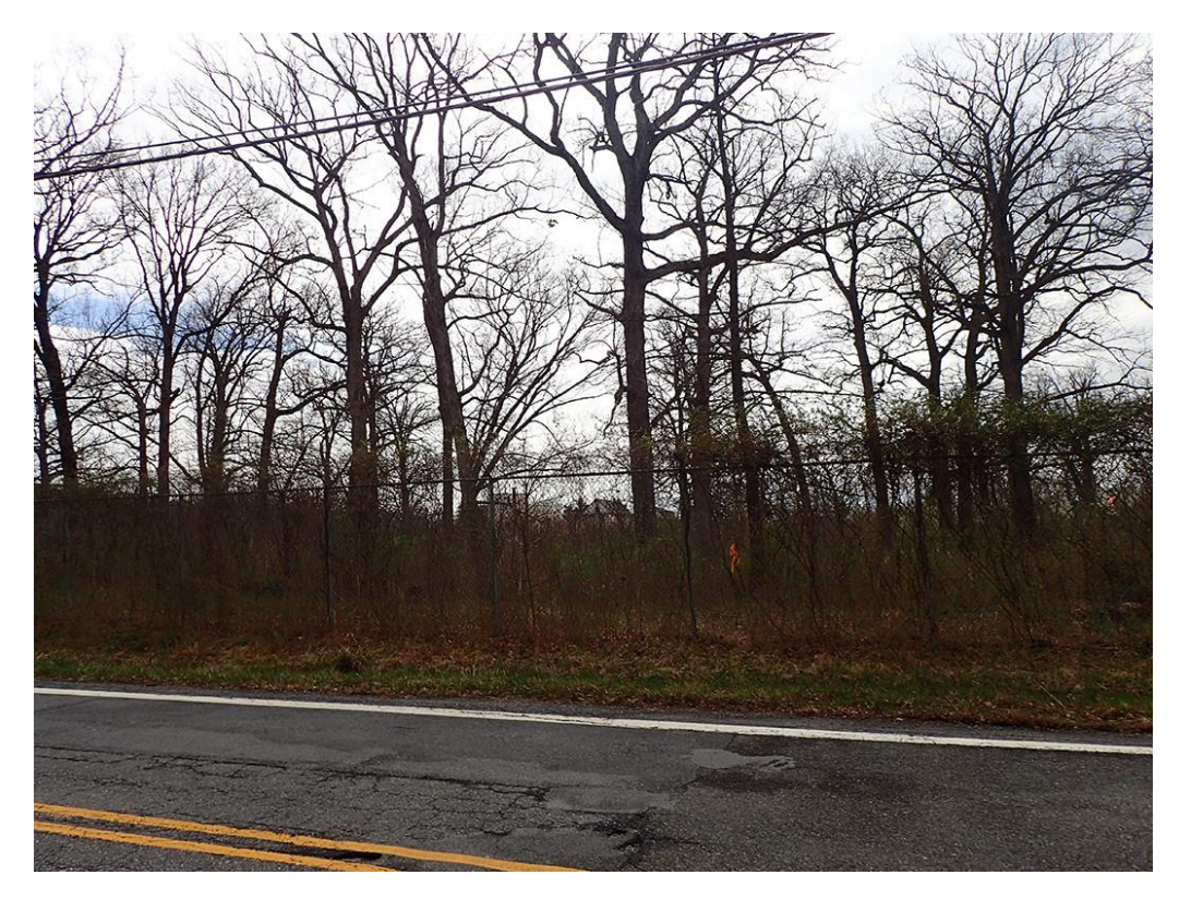
Figure 4: Viewpoint 2, Odell Road Facing South, under Existing Conditions