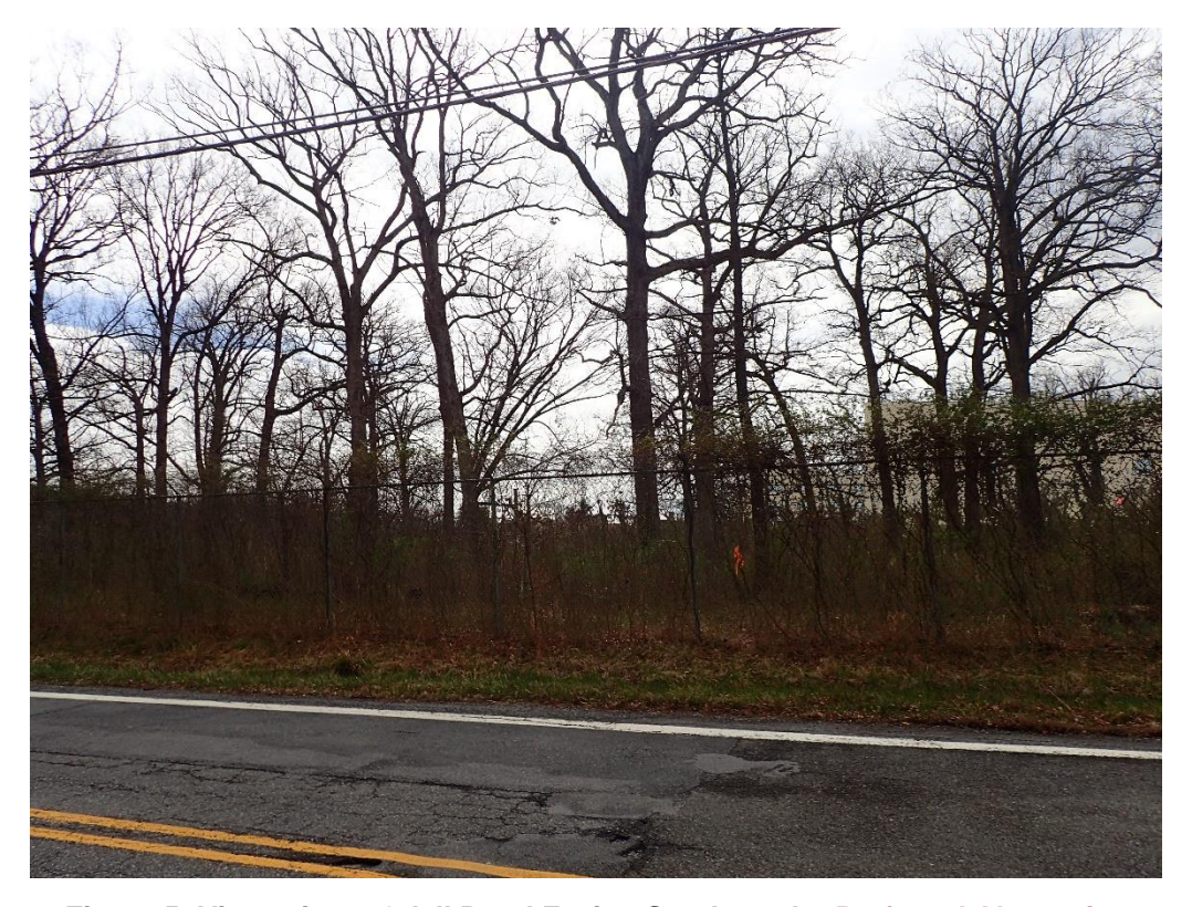
Figure 5: Viewpoint 2, Odell Road Facing South, under <a href="Preferred Alternative">Preferred Alternative</a>