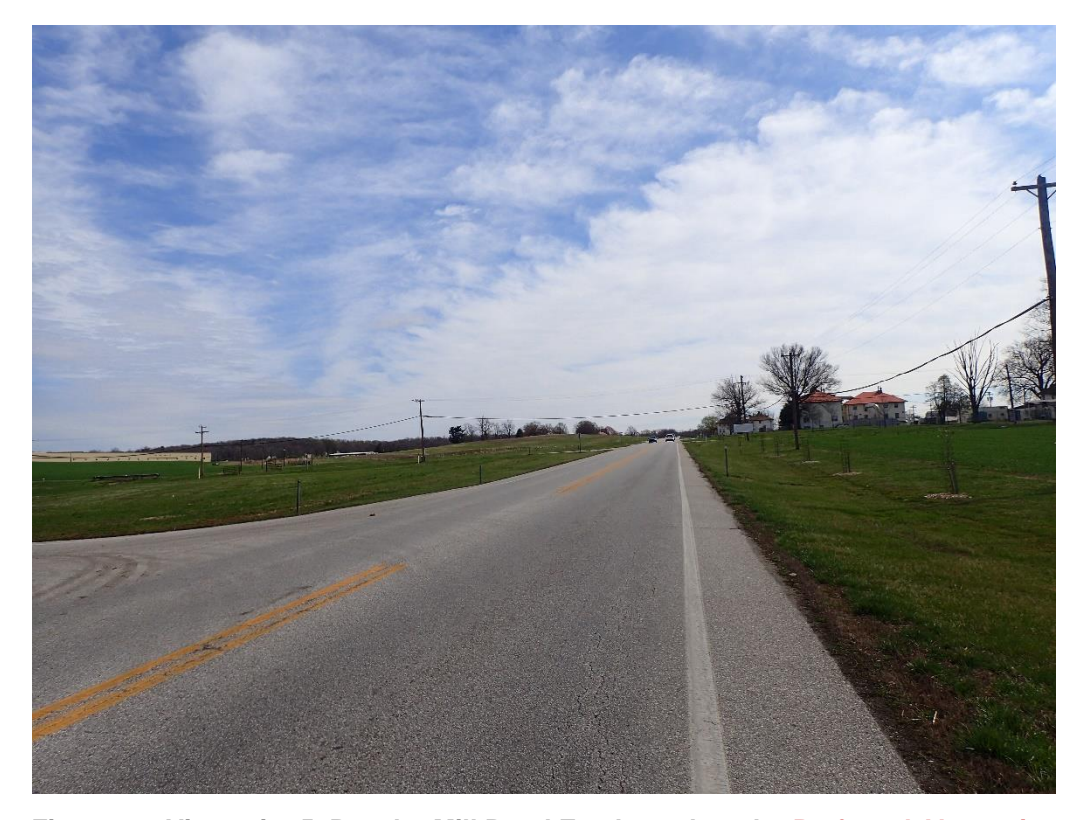
Figure 11: Viewpoint 5, Powder Mill Road Eastbound, under <a href="Preferred Alternative">Preferred Alternative</a>