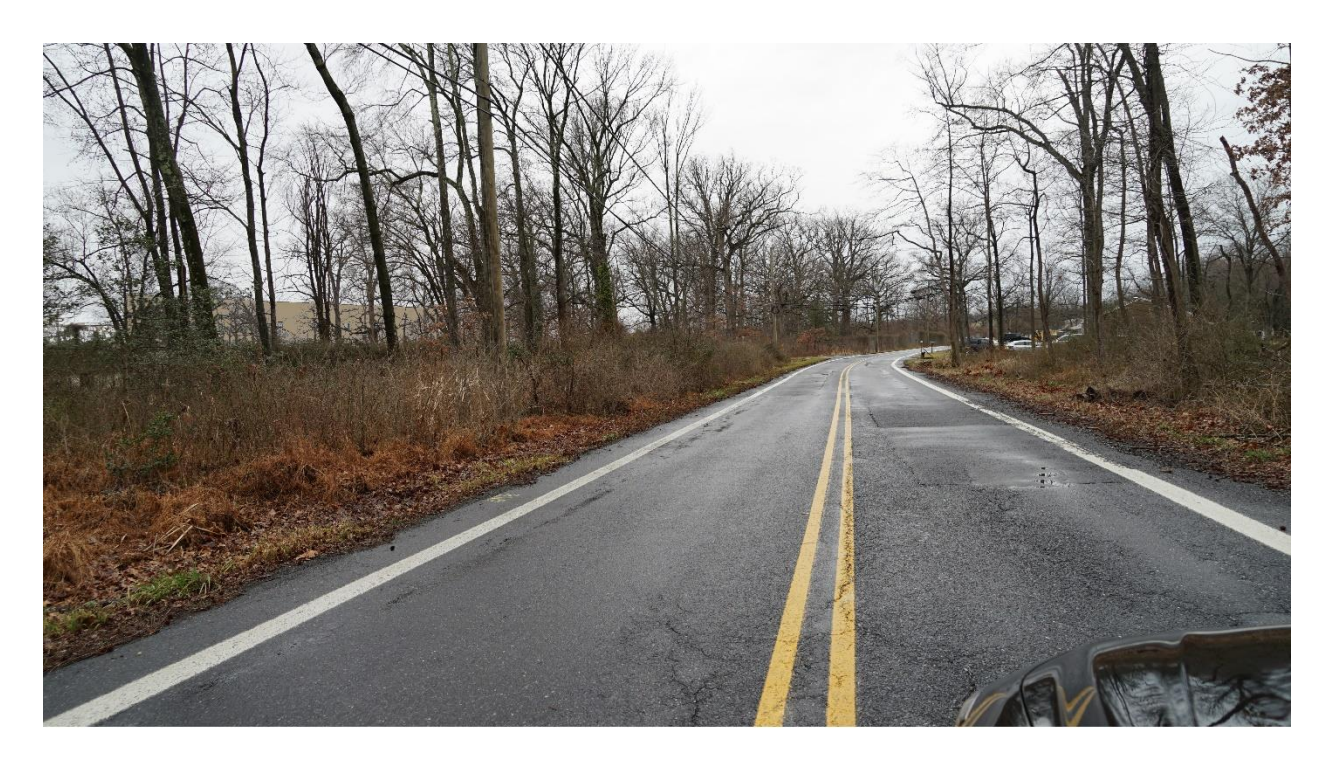
Figure 7: Viewpoint 3, Odell Road Westbound, under <a href="Preferred Alternative">Preferred Alternative</a>