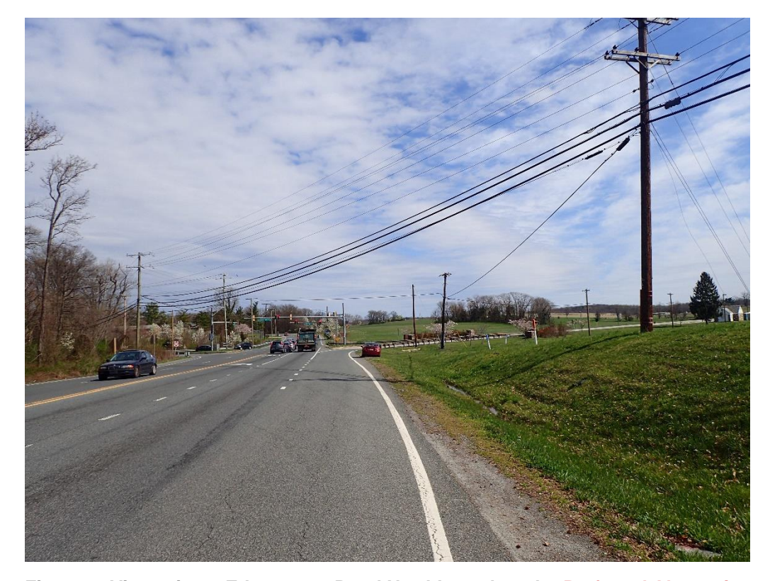
Figure 9: Viewpoint 4, Edmonston Road Northbound, under <a href="Preferred Alternative">Preferred Alternative</a>