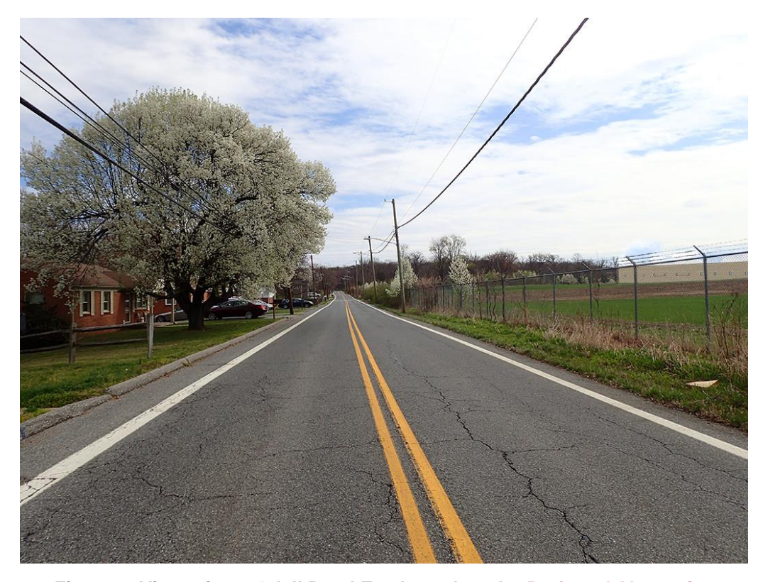
Figure 3: Viewpoint 1, Odell Road Eastbound, under <a href="Preferred Alternative">Preferred Alternative</a>