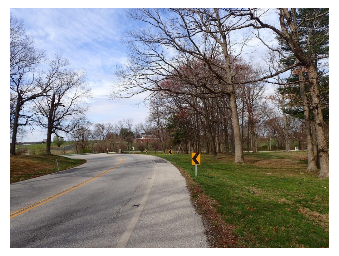
Figure 13: Viewpoint 6, Powder Mill Road Westbound, under <a href="Preferred Alternative">Preferred Alternative</a>