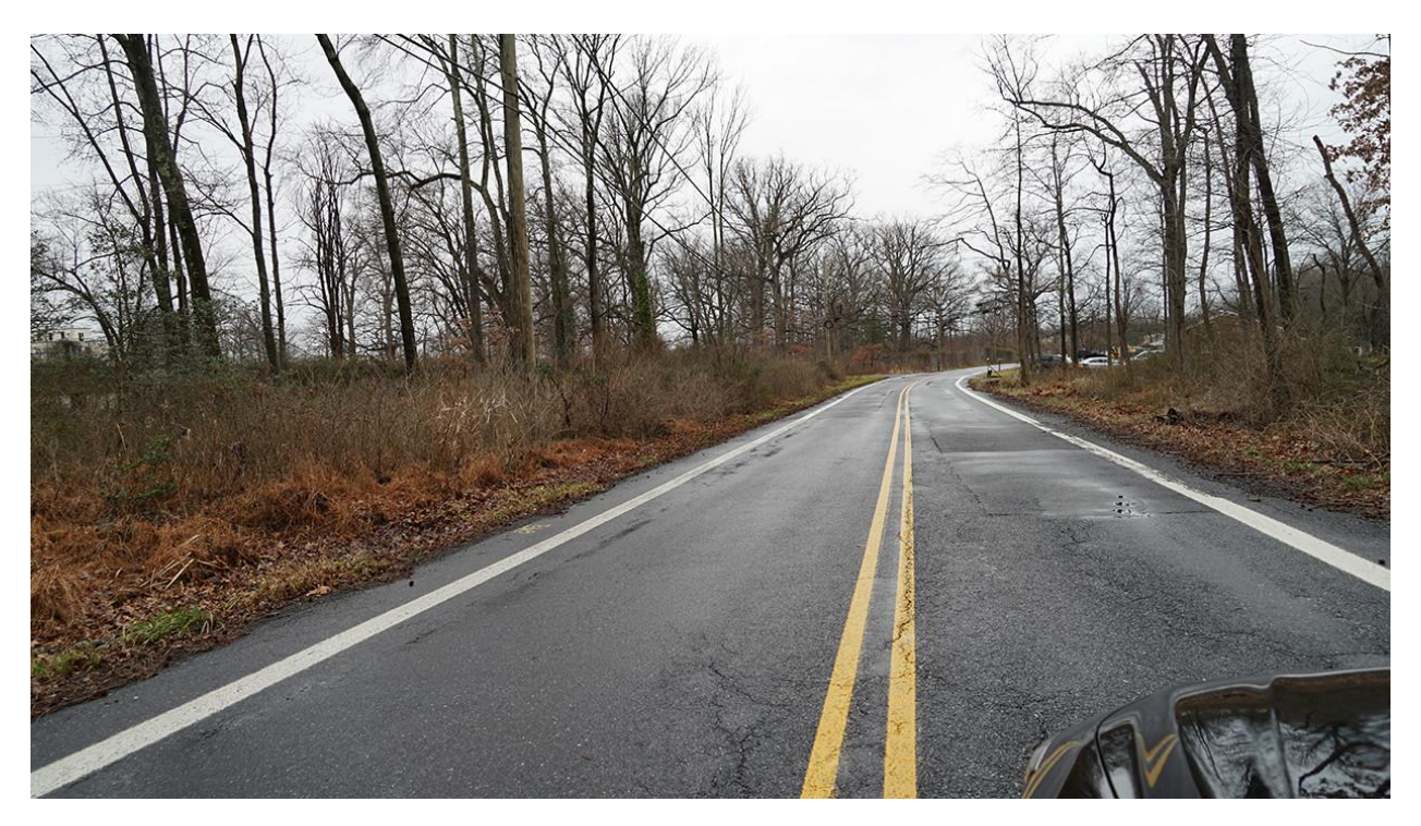
Figure 6: Viewpoint 3, Odell Road Westbound, under Existing Conditions