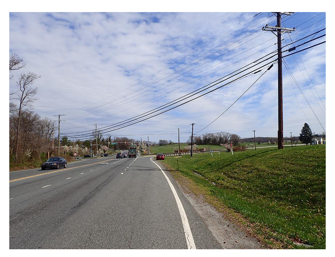
Figure 8: Viewpoint 4, Edmonston Road Northbound, under Existing Conditions