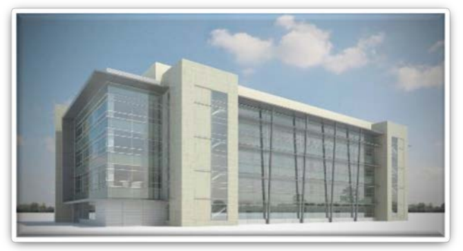
East Campus Building Marine Corps