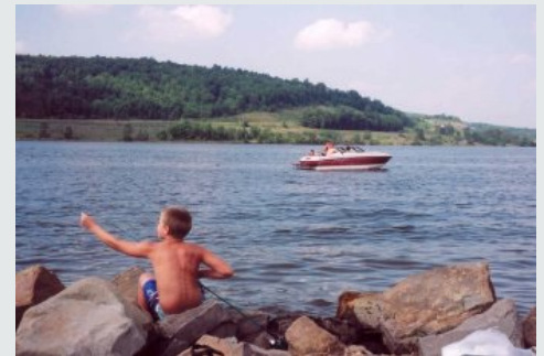
Tioga-Hammond and Cowanesque Lakes, PA

Recreation opportunities at Jennings Randolph Lake include boat ramps for fishing and boating, beach and picnic areas, and the Robert W. Craig campground.