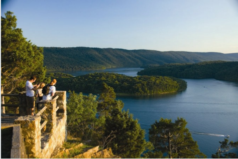
Raystown Lake, PA

The U.S. Army Corps of Engineers is the largest provider of water-based outdoor recreation in the nation. The Corps' Baltimore District regulates 17 reservoirs in the State of Maryland, West Virginia, Commonwealth of Pennsylvania and the State of New York. All of these projects offer a variety of affordable recreational opportunities, and many of them are within 200 miles of the Washington, D.C., Maryland, and Virginia corridor.