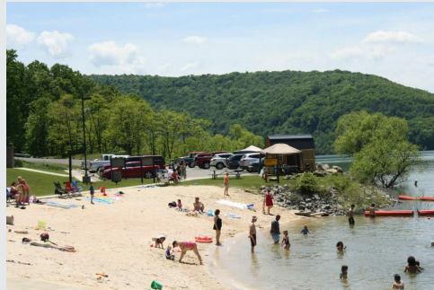
Jennings Randolph Lake MD /WV border

Visitors come to Raystown to enjoy panoramic views of undeveloped land and waters, access to excellent public recreation facilities, and fishing and hunting opportunities. From camping and boating, to hiking and world-class mountain biking, to striped bass fishing and whitetail deer hunting, and everything in between - Raystown offers something for everyone.