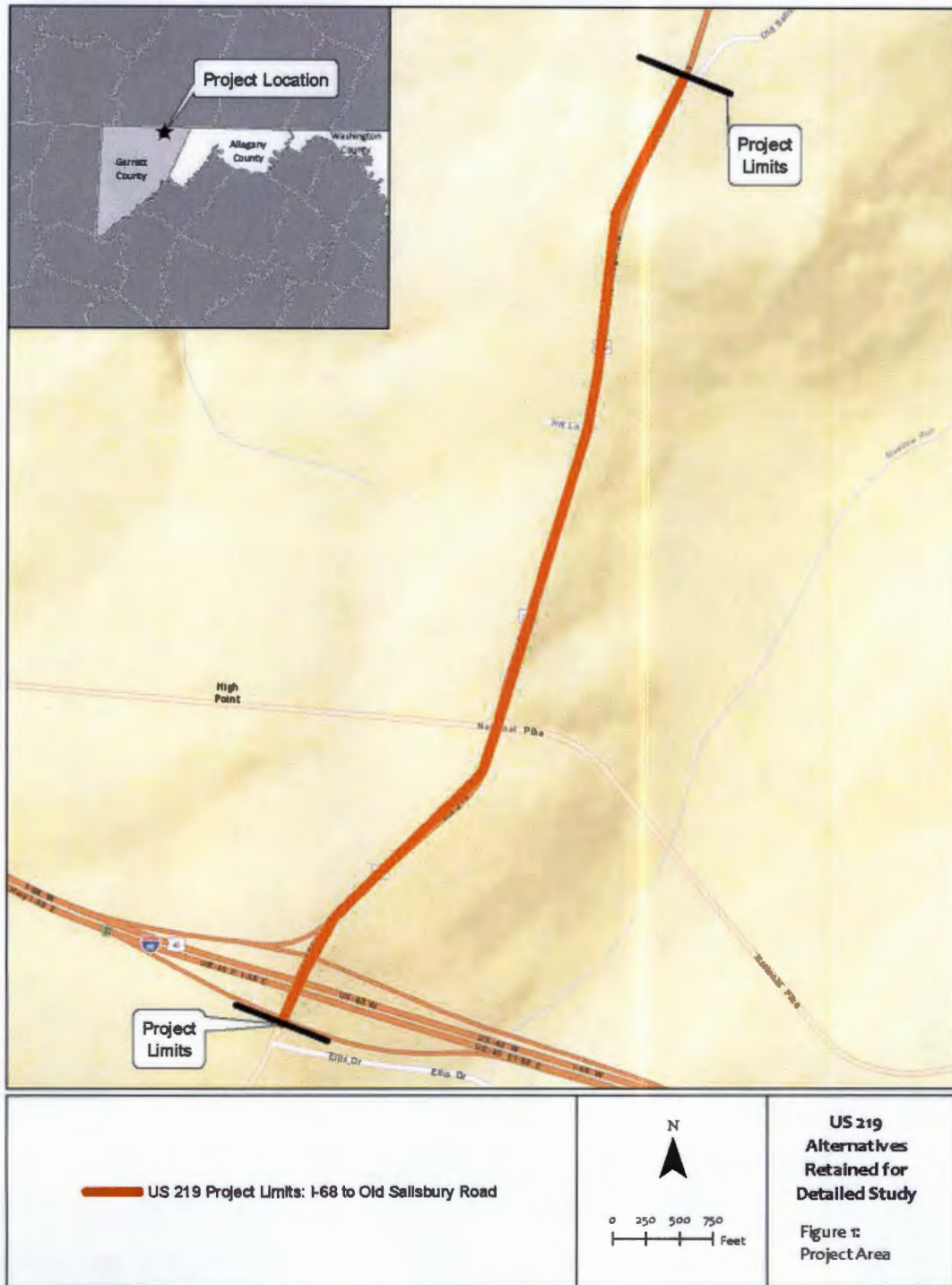
Figure 1. US 219 Improvement Project Location Map