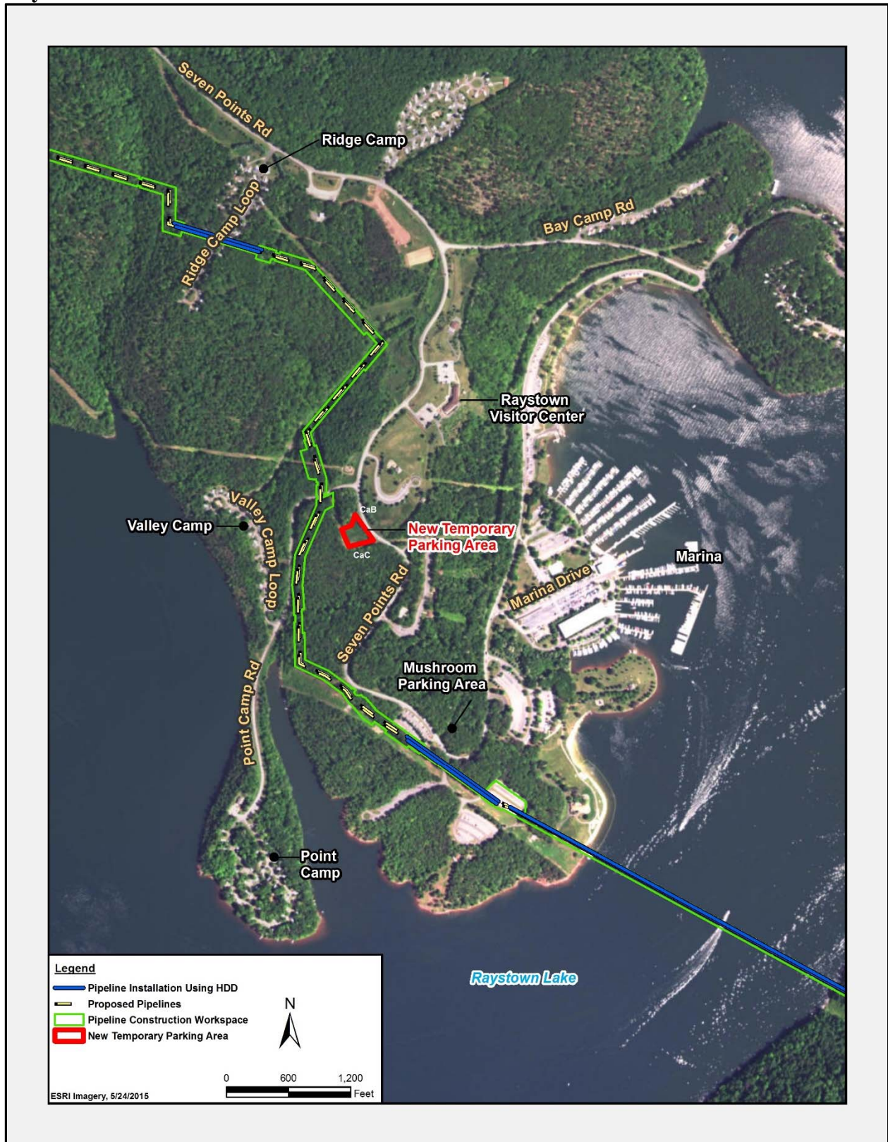
Figure 1. Location of Temporary Parking Area in Relation to Mushroom Parking Area and Raystown Lake Seven Points Recreation Area