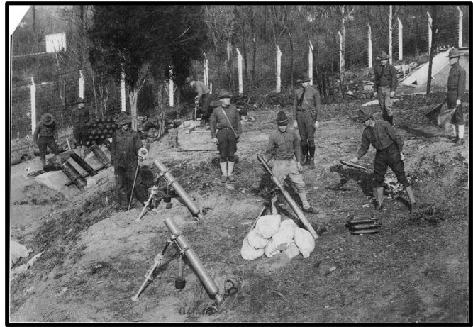
Munitions testing at the American University Experiment Station

The Spring Valley Formerly Used Defense Site (FUDS) consists of approximately 661 acres in Northwest Washington, D.C. During the World War I-era, the site was known as the American University Experiment Station (AUES) and Camp Leach. It was used by the U.S. government for engineer troop training, research and testing of chemical agents, equipment, and munitions. Between 1993 and 2014, the U.S. Army Corps of Engineers performed investigations to gather the data necessary to determine the nature and extent of known contamination, assess risk to human health and the environment, and establish criteria for possible cleanup actions associated with past Department of Defense (DoD) activities. During the investigations, the Corps of Engineers also removed munitions related items and arsenic contaminated soil.