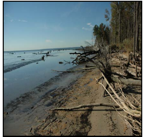
View of Franklin Point Park, Anne Arundel

STATUS: The Initial Assessment Factsheet was resubmitted to North Atlantic Division and received approval on 10 July 2012. Due to higher funding priorities at MD-DNR, they are unable to negotiate and execute Feasibility Cost Sharing agreement at this time. The Baltimore District will follow up with the sponsor to determine if there is still interest in pursuing or terminating the study.