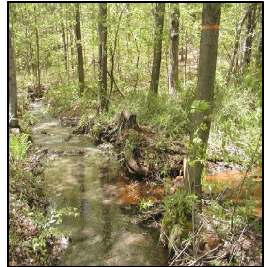
View of Shoups Run in Huntington County, PA

STATUS: The project is currently on hold pending funding. Funds could be used to finalize and obtain approval of the Preliminary Restoration Plan. The Baltimore District will follow up with the sponsor to determine if there is still interest in pursuing or terminating the study in fiscal 2015.