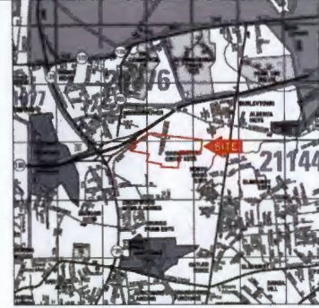
Vicinity Map 1"=2000"