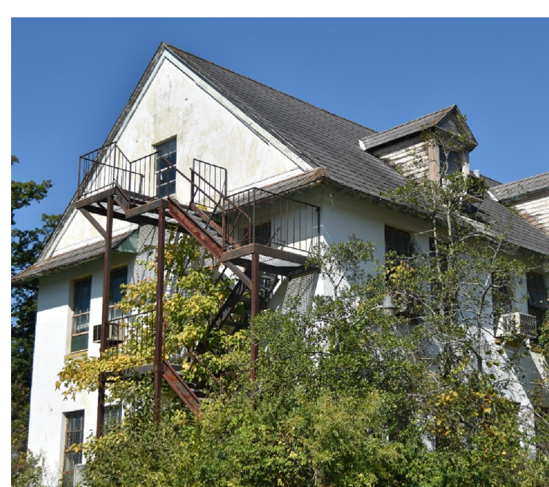
Condition of Building 265 as of 2019.