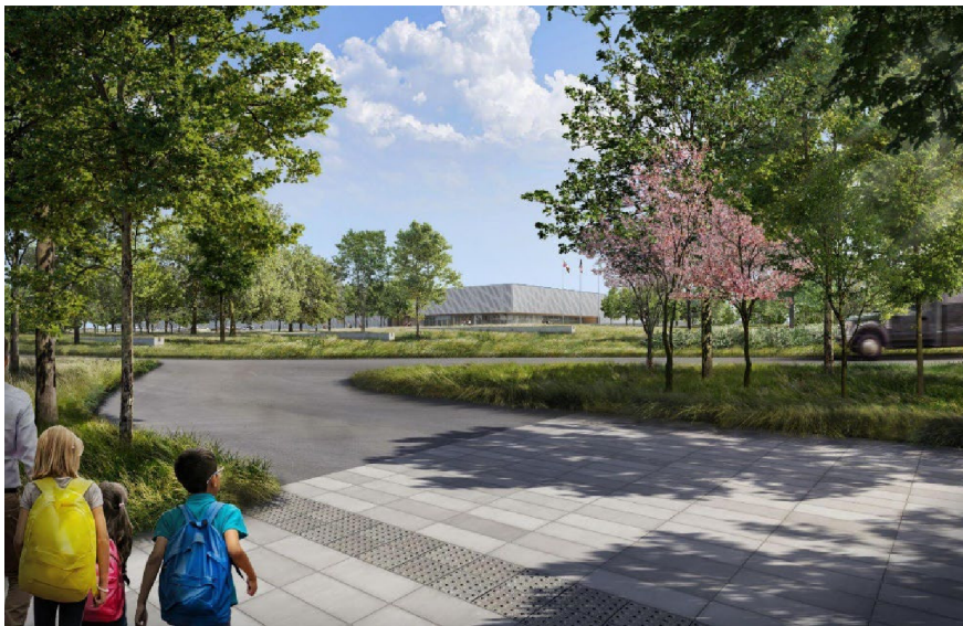
Rendering showing main building entrance from visitor center

Final design of the replacement Currency Production Facility (CPF) is ongoing, and over the past several months this process has included coordination with utilities and permitting agencies, end-user coordination, and design progression. Some updates and expected upcoming milestones include: