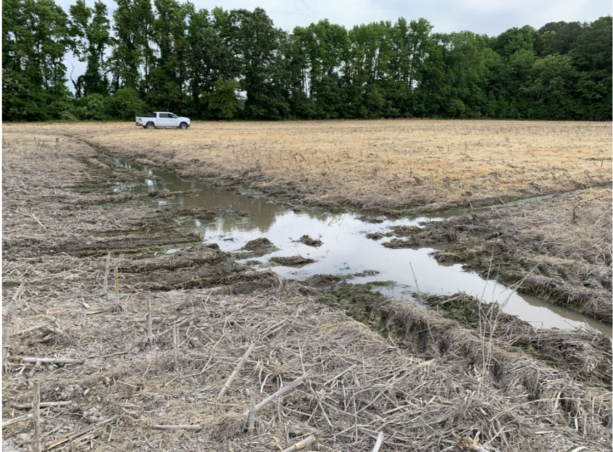
Figure 4 Poned NTW C – Typical of NTW conditions

SUBJECT: 2023 Rule, as amended, Approved Jurisdictional Determination in Light of Sackett v. EPA , 143 S. Ct. 1322 (2023), NAB-2025-00569-M51 (Ewing Farms - K. Hovanian Homes/ AJD)