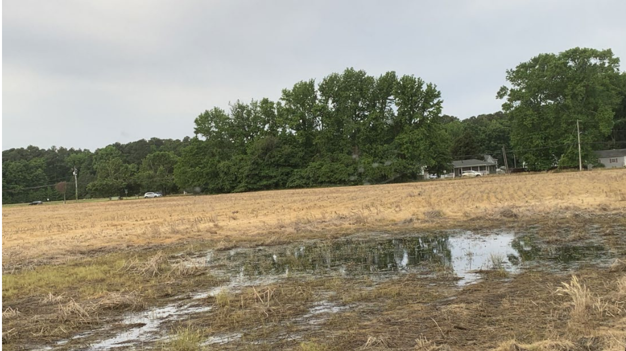
Figure 5 Ponded NTW D – more ponded than other NTWs on site, but isolated.

SUBJECT: 2023 Rule, as amended, Approved Jurisdictional Determination in Light of Sackett v. EPA , 143 S. Ct. 1322 (2023), NAB-2025-00569-M51 (Ewing Farms - K. Hovanian Homes/ AJD)