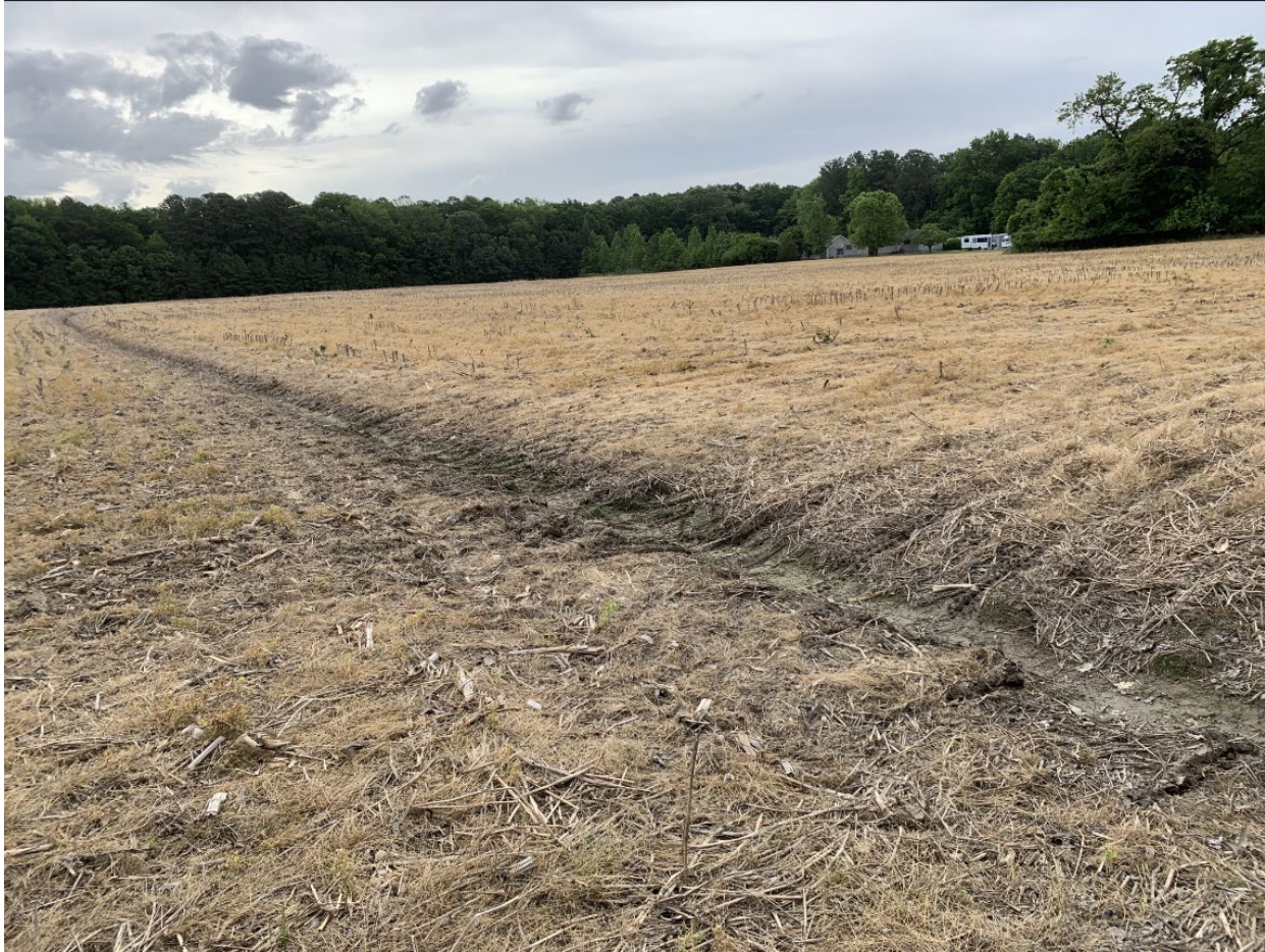
Figure 2 Typical condition of feeder ditches.

SUBJECT: 2023 Rule, as amended, Approved Jurisdictional Determination in Light of Sackett v. EPA , 143 S. Ct. 1322 (2023), NAB-2025-00569-M51 (Ewing Farms - K. Hovanian Homes/ AJD)