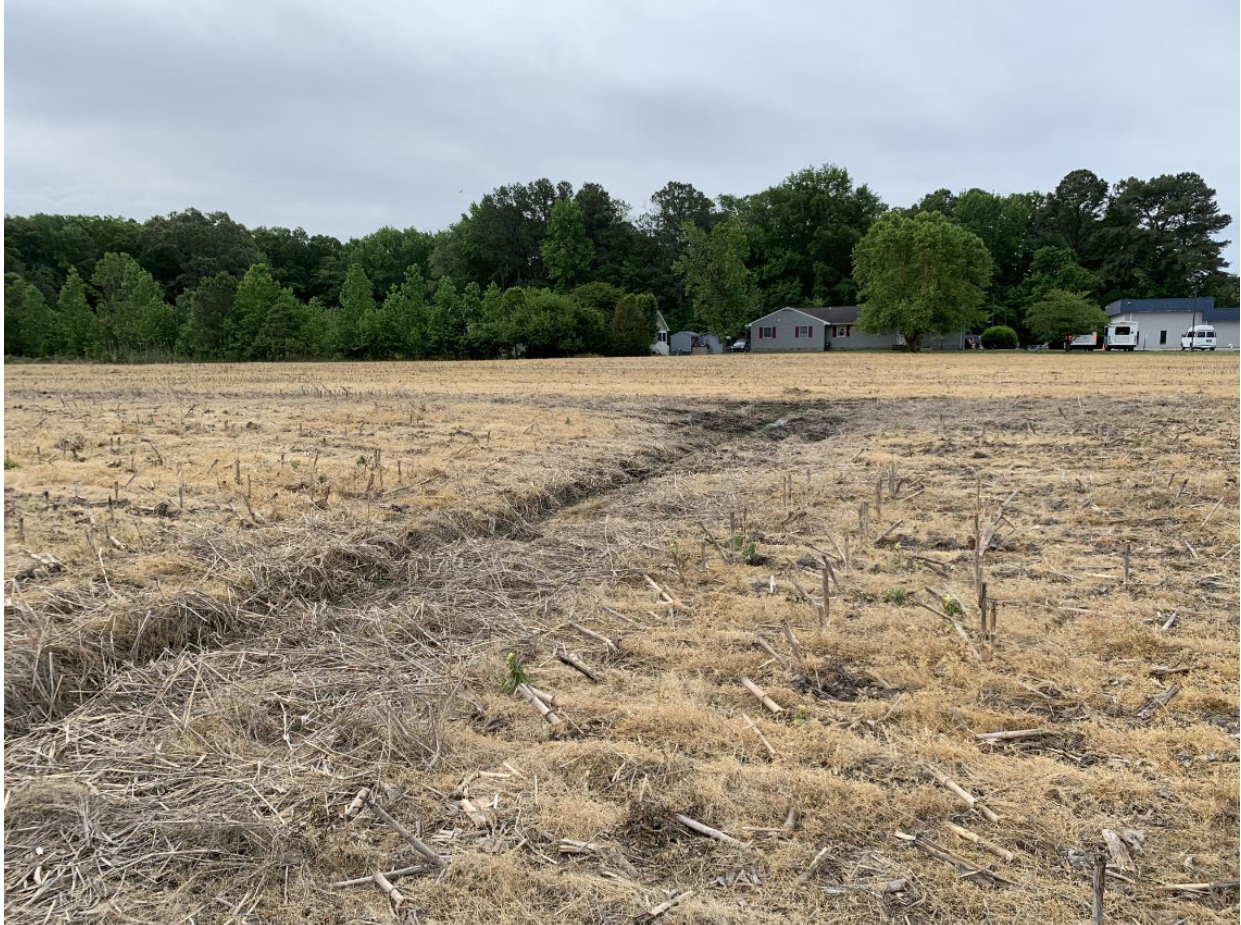
Figure 3 Typical condition of mainstem agricultural ditches.

SUBJECT: 2023 Rule, as amended, Approved Jurisdictional Determination in Light of Sackett v. EPA , 143 S. Ct. 1322 (2023), NAB-2025-00569-M51 (Ewing Farms - K. Hovanian Homes/ AJD)