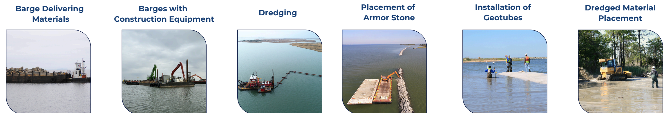
Examples of Phase 2 Construction Activities