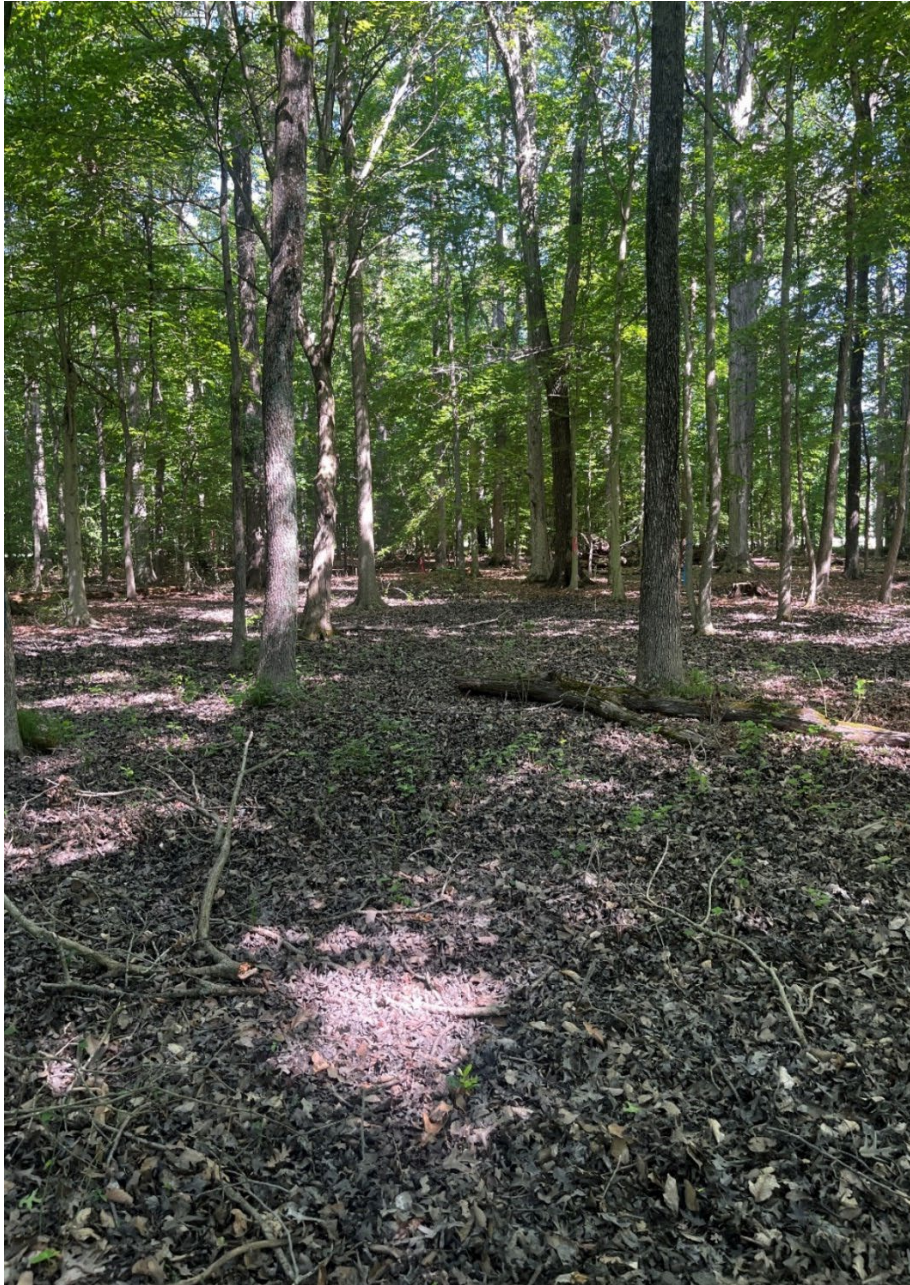
Figure 2. View of Wetland 1 located towards the center of the AOR. This wetland is seasonally saturated and driven mainly by precipitation but is non-jurisdictional as it does not have a continuous surface connection to a TNW.

SUBJECT: US Army Corps of Engineers (Corps) Approved Jurisdictional Determination in accordance with the "Revised Definition of 'Waters of the United States'"; (88 FR 3004 (January 18, 2023) as amended by the "Revised Definition of 'Waters of the United States'; Conforming" (8 September 2023), 1 NAB-2024-00111-M3 (Muirfield Lot).