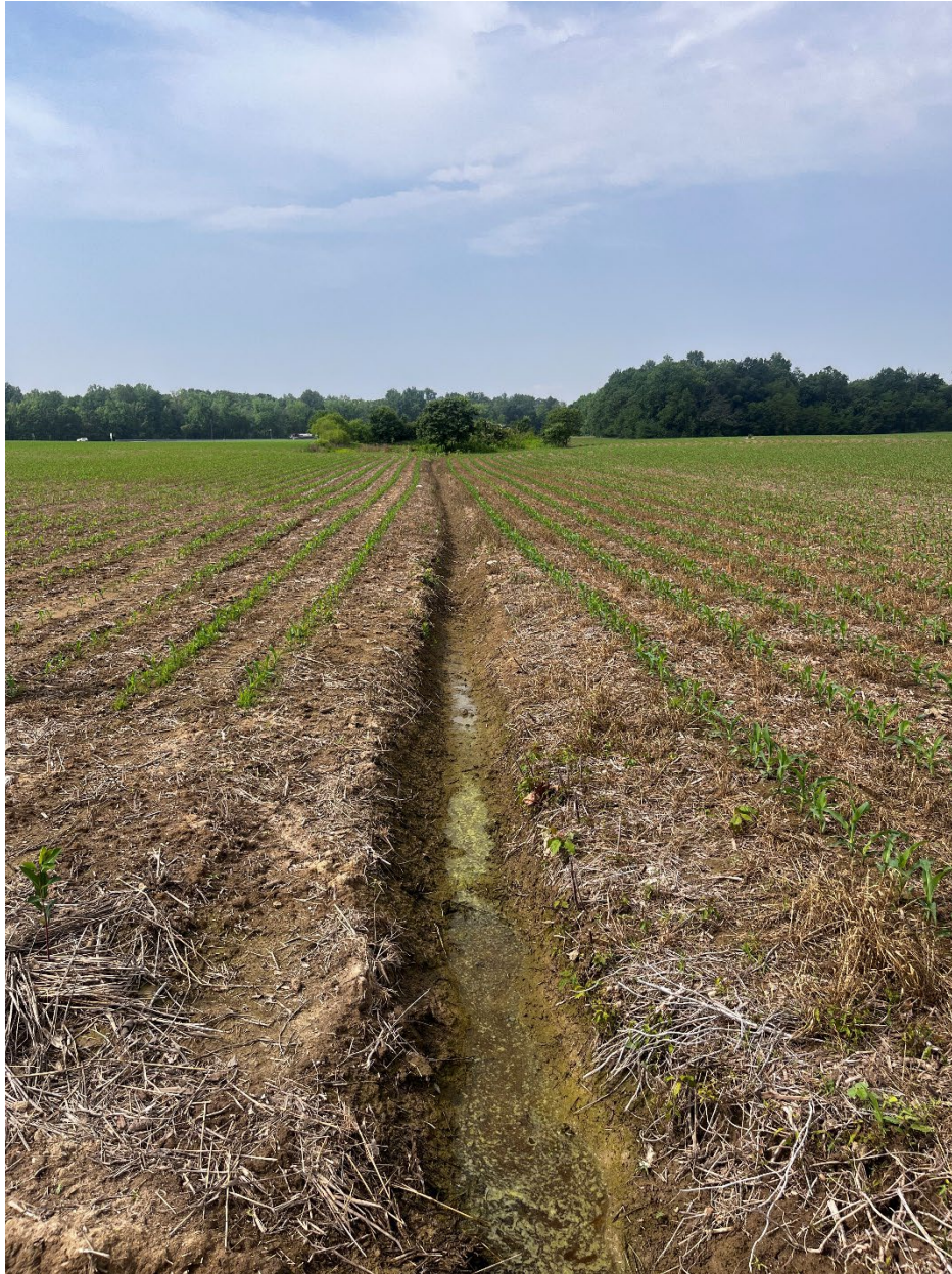
Figure 3: Non-jurisdictional agricultural ditch located in the agricultural field.

SUBJECT: 2023 Rule, as amended, Approved Jurisdictional Determination in Light of Sackett v. EPA , 143 S. Ct. 1322 (2023), NAB-2025-00254-M53 (MD QA15 Little Farm Lane Solar/AJD)