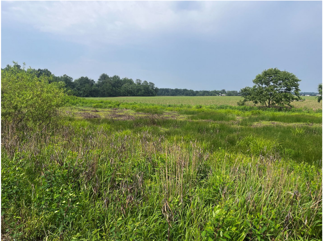
Figure 5: Non-jurisdictional non-tidal wetland, NTW1.

SUBJECT: 2023 Rule, as amended, Approved Jurisdictional Determination in Light of Sackett v. EPA , 143 S. Ct. 1322 (2023), NAB-2025-00254-M53 (MD QA15 Little Farm Lane Solar/AJD)