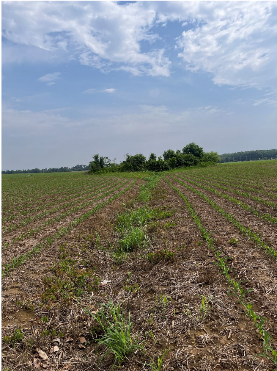
Figure 4: Non-jurisdictional wetland, NTW1 with drainage feature.

SUBJECT: 2023 Rule, as amended, Approved Jurisdictional Determination in Light of Sackett v. EPA , 143 S. Ct. 1322 (2023), NAB-2025-00254-M53 (MD QA15 Little Farm Lane Solar/AJD)