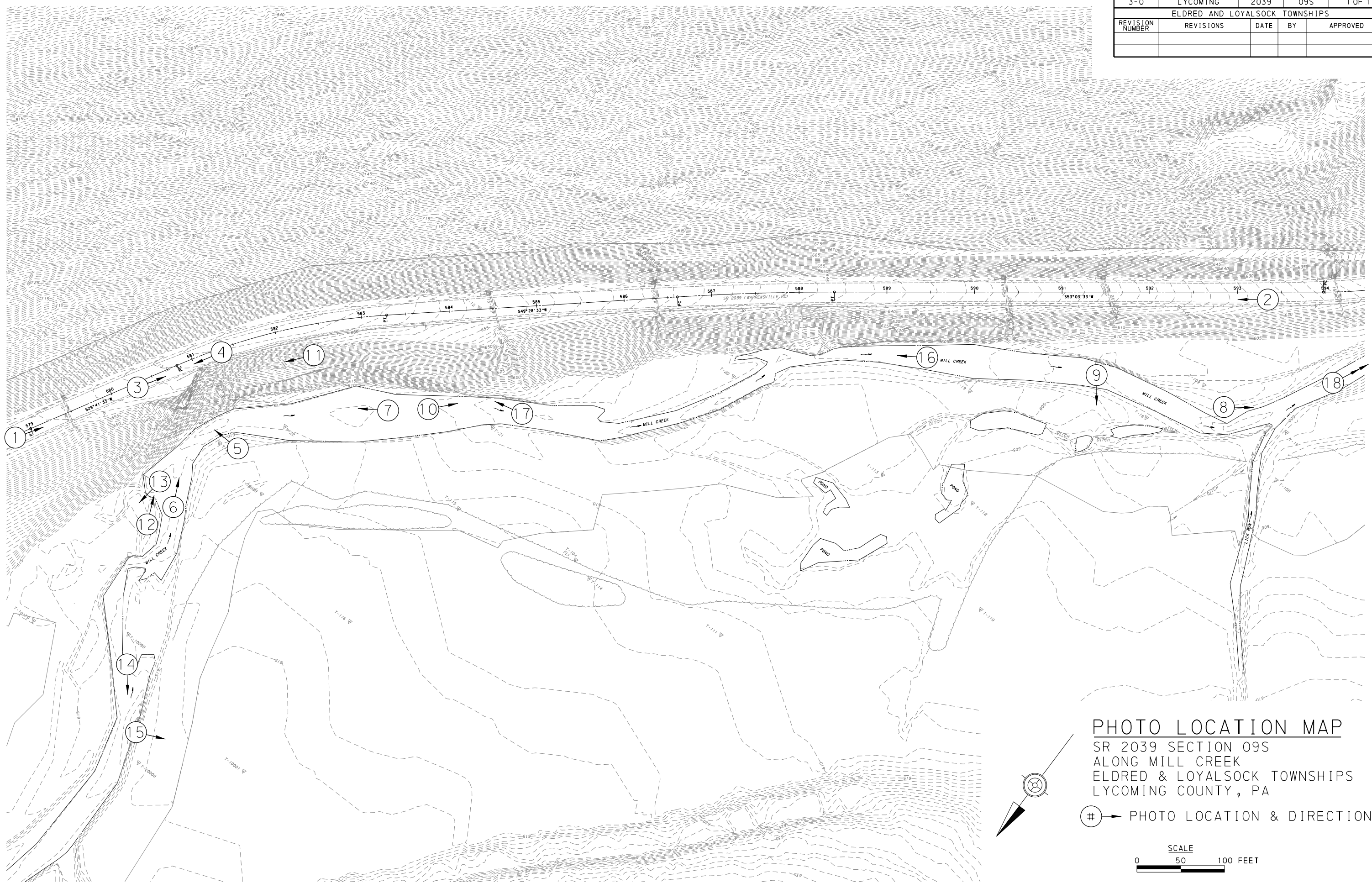
PHOTO LOCATION MAP SR 2039 SECTION 09S ALONG MILL CREEK ELDRED & LOYALSOCK TOWNSHIPS LYCOMING COUNTY, PA