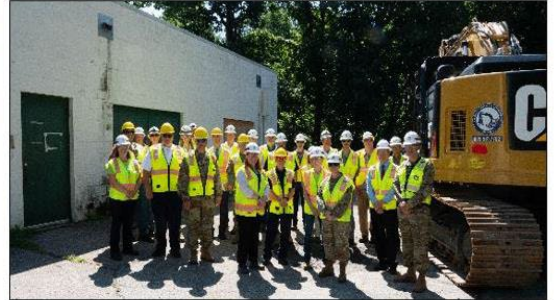
Team photo in front of the Mechanical Shop before demo began.