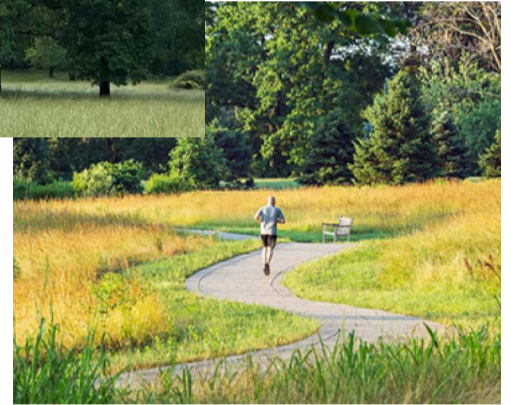
Rendering of the proposed wetland conservation area in the southeastern corner of the site.