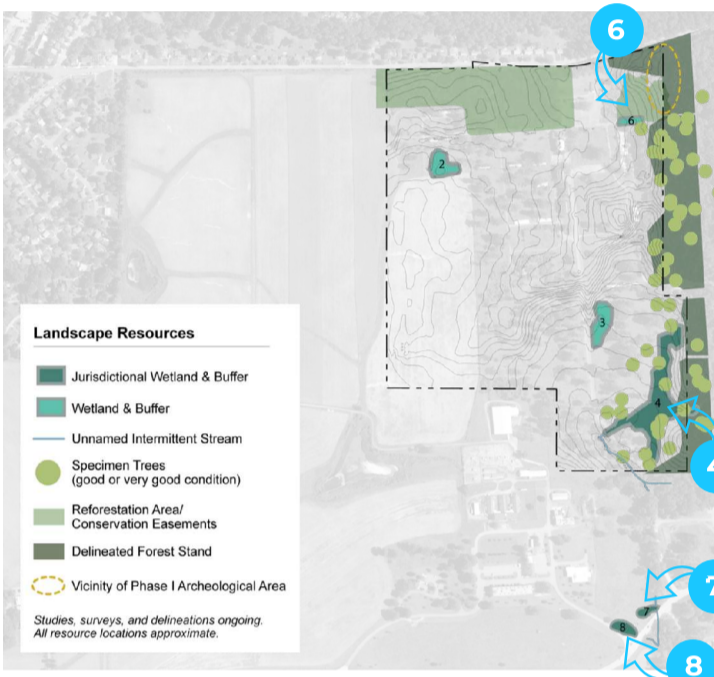
Map showing locations of existing landscape resources.

Water resources are an important consideration as the design for the replacement facility is developed. BEP has worked closely with the designer to avoid impacts to water resources when possible, and to feature some of these water resources in the landscape design (currently at 35-percent concept design). Additional water resources information for the replacement facility is available on the project website. The current design proposes to preserve Wetland 4 on the map below as a wetland conservation area and landscape feature. Wetland 6 will also be avoided, and Wetlands 7 and 8 and the intermittent stream will be avoided to the extent practicable.