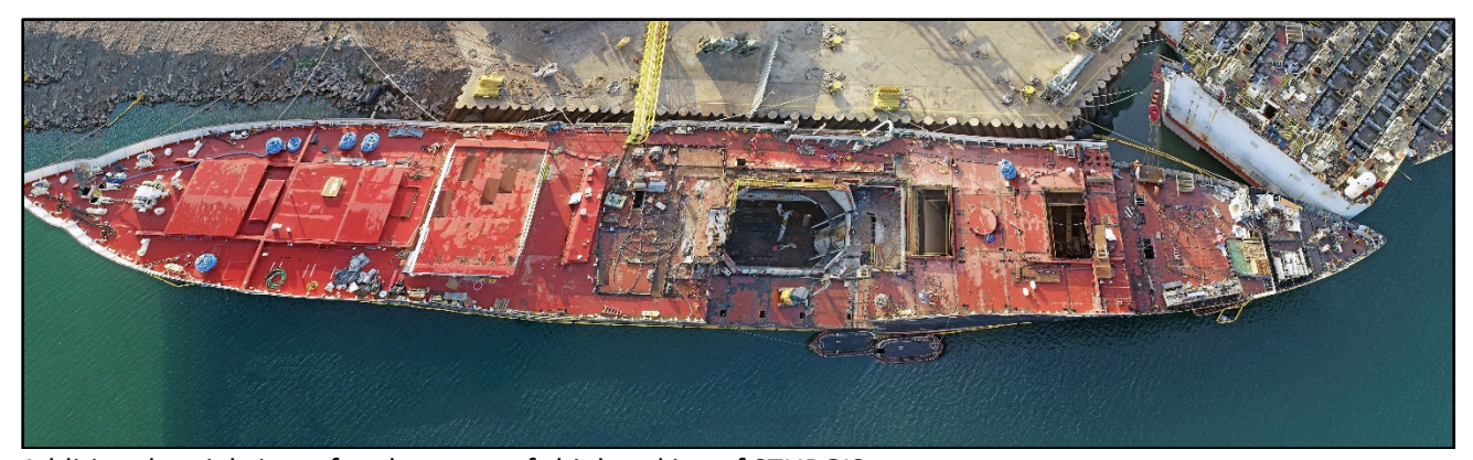
Additional aerial view of early stages of shipbreaking of STURGIS