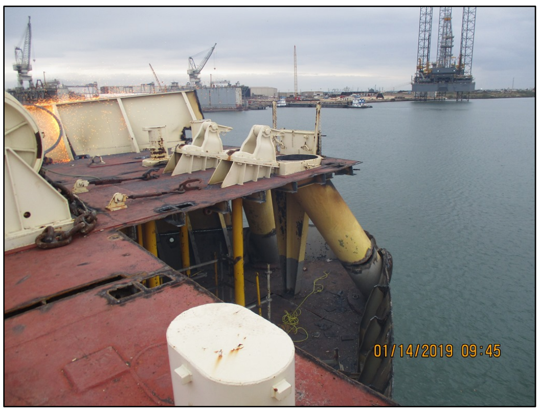
View off the bow of STURGIS with main deck pieces removed