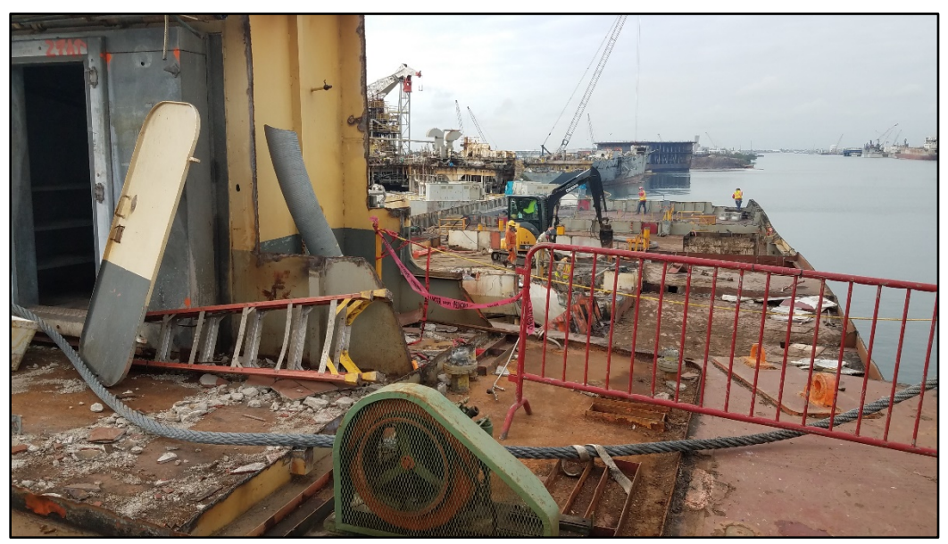
Shipbreaking crews working on the main deck of the STURGIS