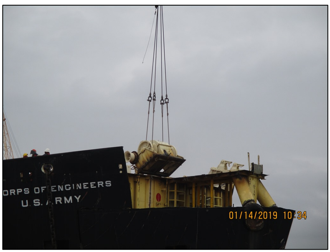
Anchor winch being removed via crane