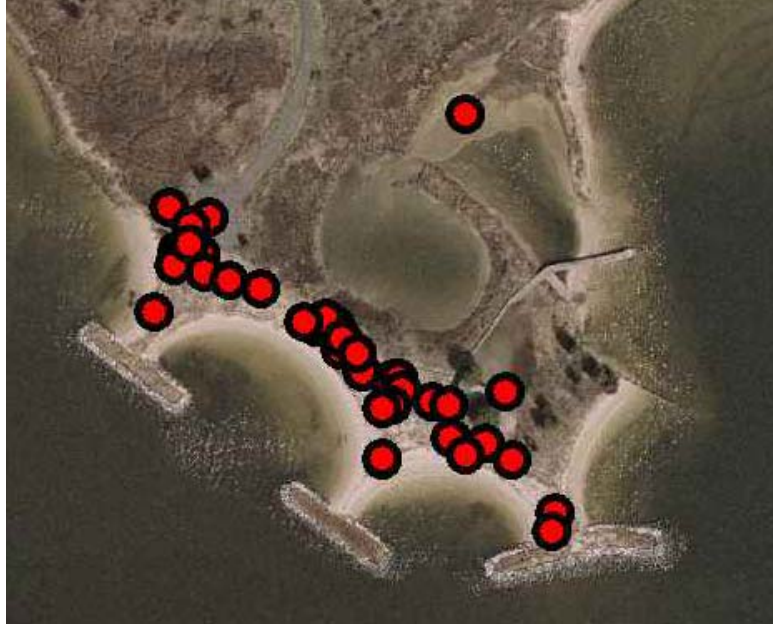
Figure 5 – Shoreline stabilization and the creation of terrapin nesting habitat in Calvert County Maryland – Red dots indicate terrapin nests.

Fourth, the continuation and the expansion of the mark-recapture study, funded by external agencies (terrapin working group, MD-DNR etc.), to develop a more robust data set to evaluate the changes in the terrapin population that may be occurring around the island. A particular emphasis should be made to investigate those factors that are