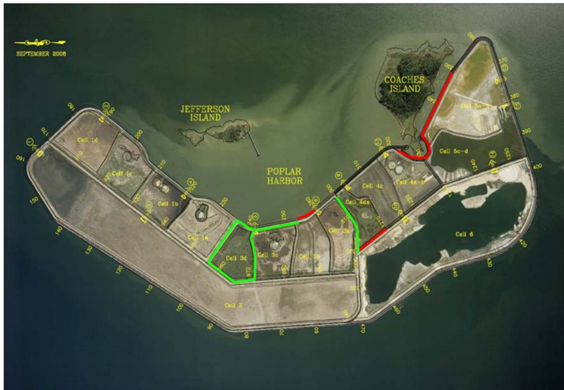
Figure 1. Red indicates areas on the PIERP that were monitored daily for terrapin nests by the research team. Green area were monitored more 2-3 times per week.

Researchers excavated nests ten days after the last hatchling emerged. For each nest, they recorded the number of live hatchlings, dead hatchlings that remained buried, eggs with dead embryos, and eggs that showed no sign of development. To estimate