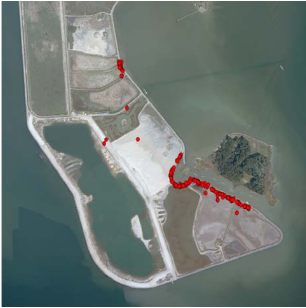
Figure 3 – Terrapin nesting locations on the PIERP during 2009

Willetts ( Catoptrophorus semipalmatus ) and small mammals, most likely a shrew ( Blarina spp. ).