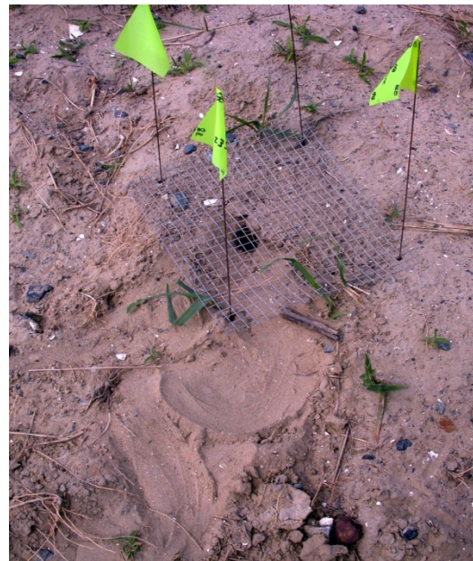
Figure 4. A terrapin nest that had been eaten by a king snake. Note the telltale markings anterior in the lower half of the picture that were created while the snake burrowed into the nest.

Since 2006 researchers have placed hardware cloth in the sand over the nests to prevent crow predation. Although the actual number of nests that have been lost during the last three years have remained relatively similar (Table 1), nest survivorship decreased during 2009 because of an overall lower number of nests (Figure 2). During the summer of 2009, an Eastern kingsnake, Lampropeltis getulus , was actually discovered while eating a terrapin nest and upon capture regurgitated four terrapin eggs (see cover photo). Furthermore, from this experience the research team learned the pattern left by a kingsnake when it has depredated a nest, and can therefore confidently identify nests that were consumed by a snake (Figure 4). Other nest predators that have been observed on the PIERP include