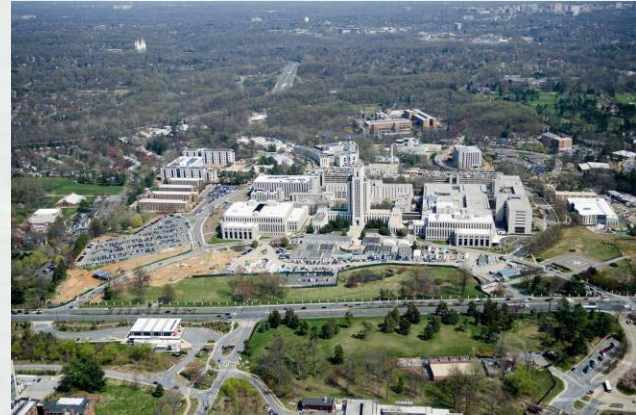
Walter Reed National Military Medical Center, Bethesda, MD