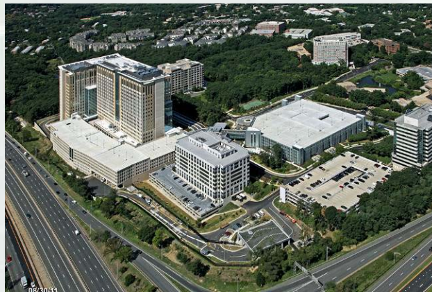
Washington Headquarters Services Alexandria, Virginia