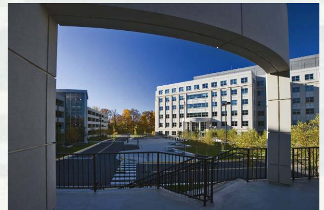
Liberty Crossing II McLean, Virginia