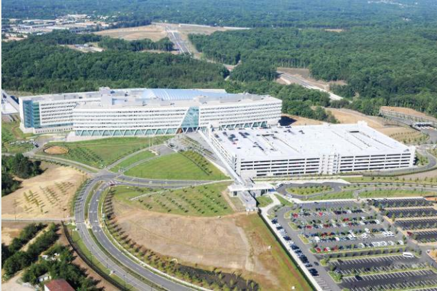
NGA Campus East Fort Belvoir, Virginia