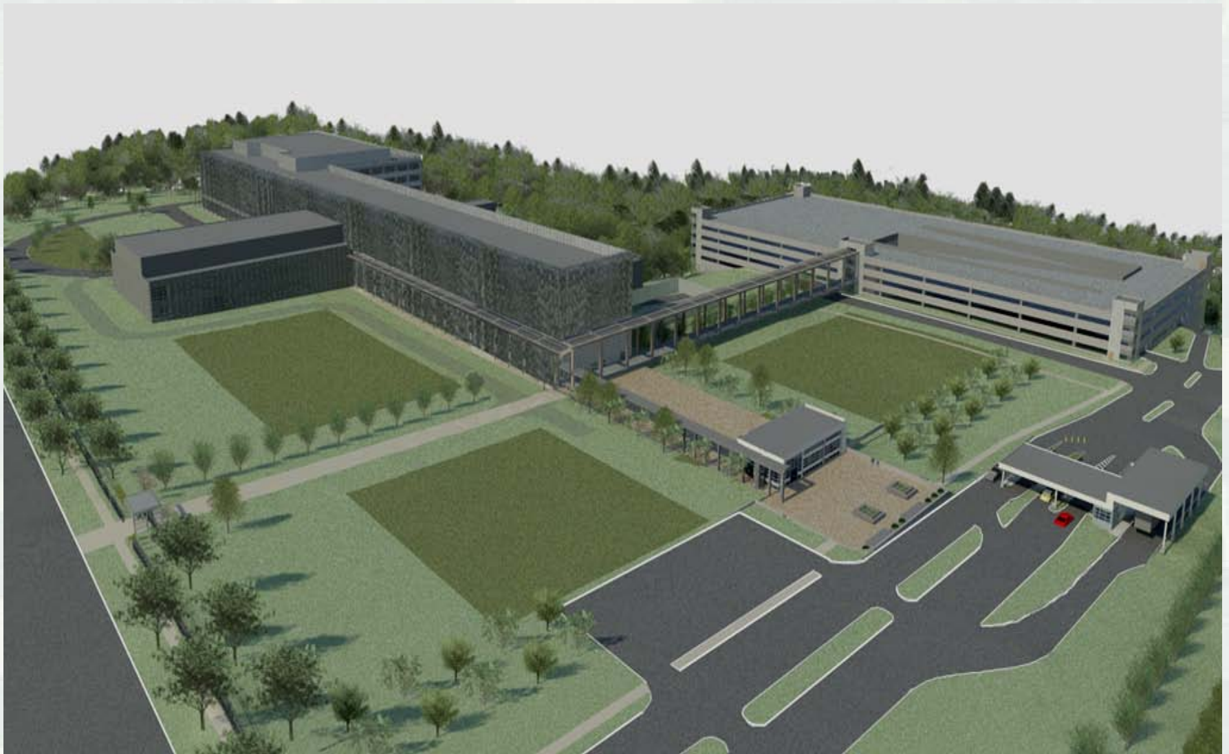
Proposed Improvements – View from Northeast