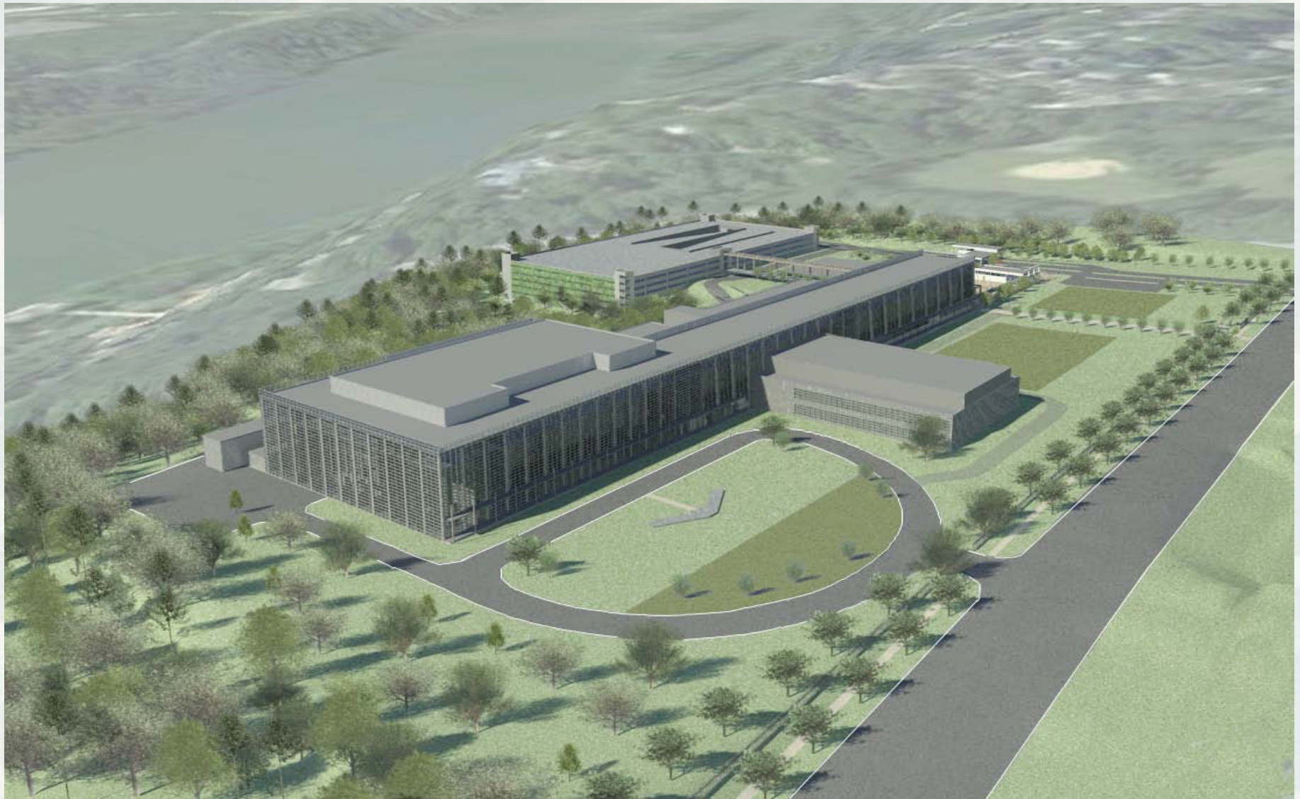
Proposed Improvements – View from Southeast