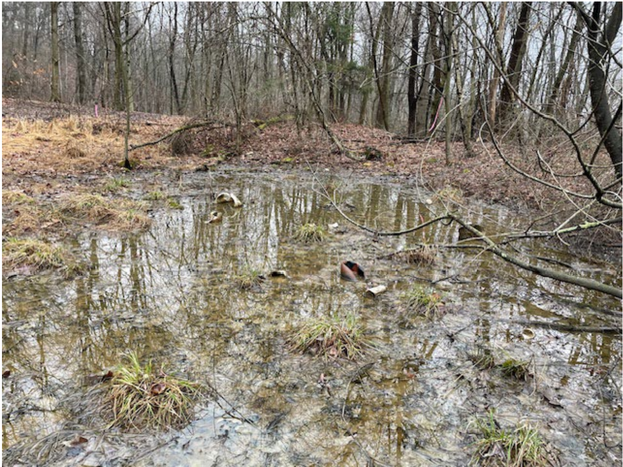
Figure 2-Depressional area with no continuous surface connection to a jurisdictional water

SUBJECT: 2023 Rule, as amended, Approved Jurisdictional Determination in Light of Sackett v. EPA , 143 S. Ct. 1322 (2023), [NAB-2024-00078]