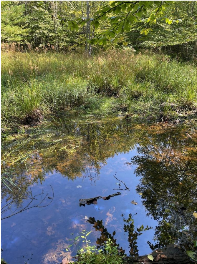
Figure 2: Example of a depressional area with no continuous surface connection to a jurisdictional water