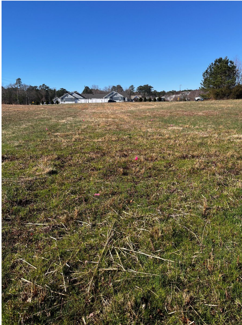
Figure 4: Non-jurisdictional, non-tidal wetlands (NTW)

CENAB-OPR-S SUBJECT: 2023 Rule, as amended, Approved Jurisdictional Determination in Light of Sackett v. EPA , 143 S. Ct. 1322 (2023), NAB-2025-00536-M53 (Nesbit Road Townhomes/AJD)