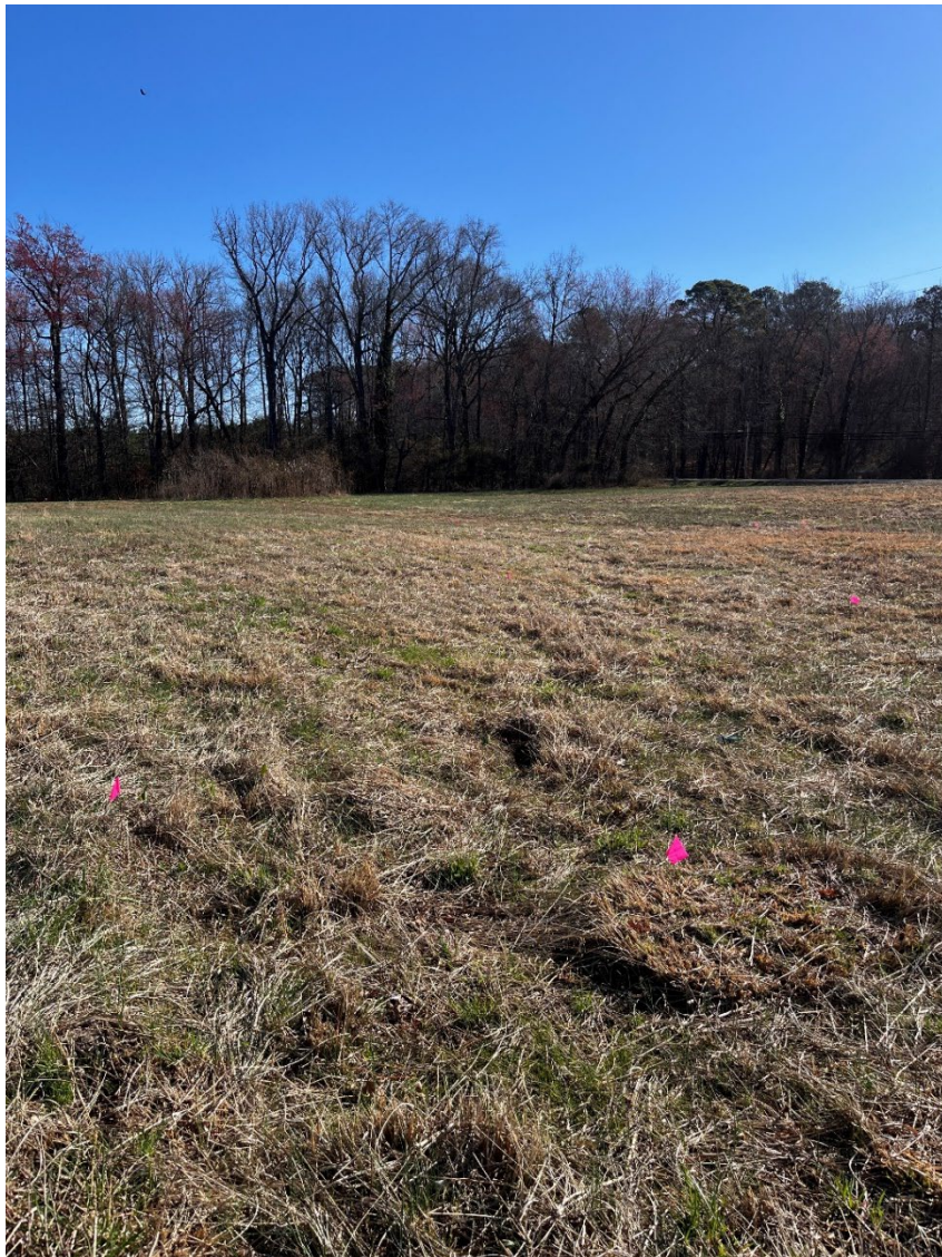
Figure 3: Non-jurisdictional, non-tidal wetlands (NTW)