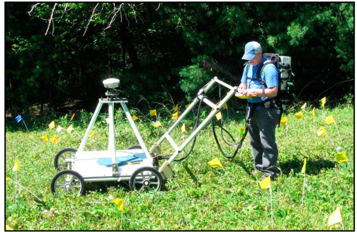
Advanced Classification technology, specifically a TEMTADS, being used to map the subsurface as part of Unexploded Ordnance Removal at New Boston Air Force Station in New Hampshire.

The purpose of the Pilot Project is to assess the possibility of using AC at residential properties within the Spring Valley FUDS during the Remedial Action phase. AC has been successfully used in other non-residential settings, but the Pilot Project will seek to determine how effective the technology is in a residential setting like Spring Valley, with varied topography