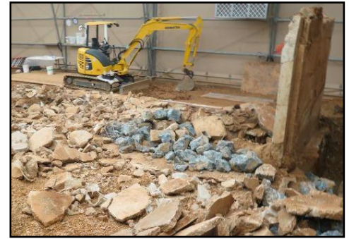
Early efforts under Tent 3 focused on demolishing the basement floor and a last remaining basement wall.

The Corps originally anticipated the high probability operations under Tent 3 would take one year with an estimated completion date in winter 2016/2017. However, we are currently on track to complete the final phase of our high probability operations six months ahead of schedule. Based on the team's latest projection, we plan